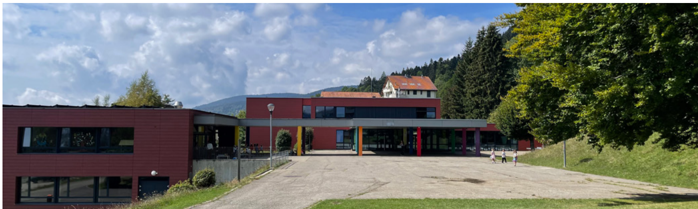
School 2 - CSVR Secondary Fontanelle

Consequently, the management team must pay special attention to communication and submit detailed proposals and reports to secure the necessary resources for the school's effective operation.