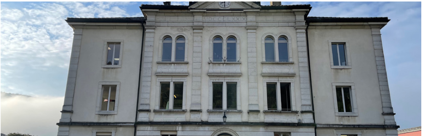
School 1 - CSV primary Dombresson

Located in the Jura Mountains, roughly 20 kilometres from the town of Neuchâtel, the Val-de-Ruz is a rural area which in recent years has attracted many families who commute to Neuchâtel for work. While the population is growing, it remains relatively homogeneous, with 13% of residents being foreign-born (compared to 30% for Switzerland overall).