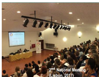
2 nd National Meeting (Lisbon, 2017)