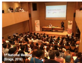
1 st National Meeting (Braga, 2016)